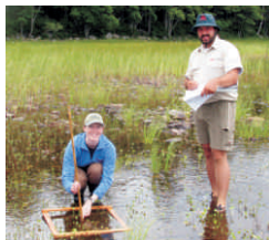
Water-pennywort monitoring (Parks Canada)