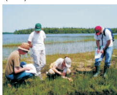
NSNT monitors identifying ACPF on Great Pubnico Lake