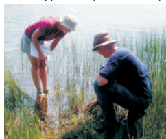
NSNT monitors identifying ACPF on Wilsons Lake