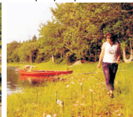
Plymouth Gentian research (Acadia University)