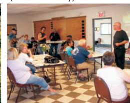
ACPF Social event