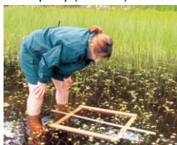
Monitoring Water-pennywort on Keji Lake