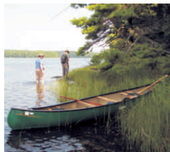
MTRI ACPF Survey