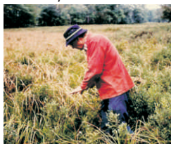
Long's Bulrush research (Mount St. Vincent University)