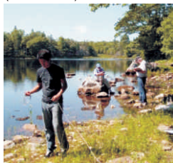
TREPA members doing an ACPF survey