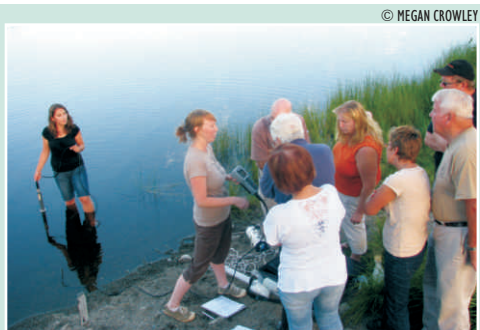
Volunteer water quality training session