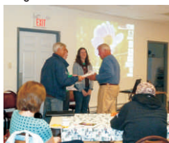
Volunteer Appreciation Event (MTRI)