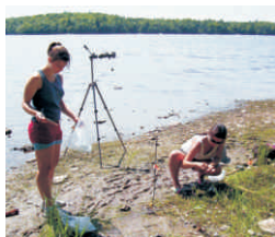
Acadia University ACPF research