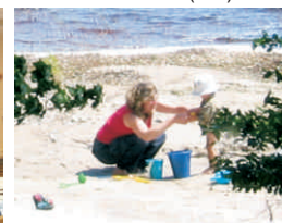
Landowners enjoying and sharing their property with ACPF